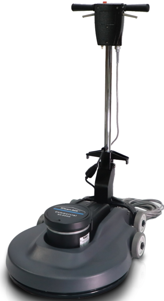
Burnisher Model: SH-2000 FA0464